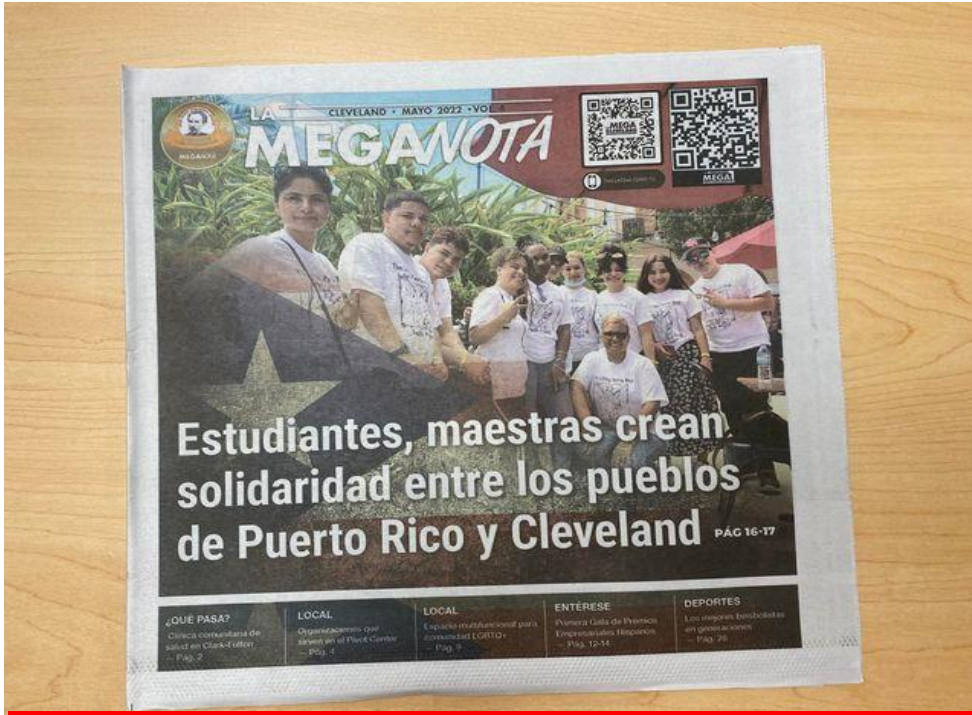
To teach, to learn, to service "Lifting Puerto Rico" Youth Project